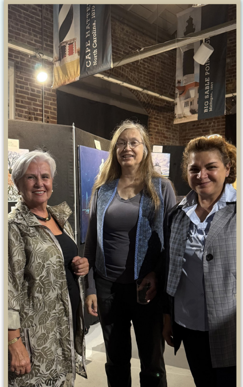
Photos from the Artist Reception on Friday, October 3rd.