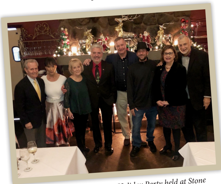
NLM Board of Trustees 2021 Holiday Party held at Stone House on the lake at Cloves Lakes Park