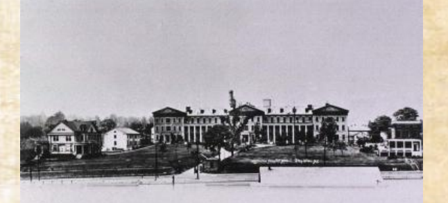
(Above) Marine Hospital & Quarantine Hospital,Staten Island

Another plan to move the Quarantine to Seguine's Point on the other side of Staten Island, was thwarted when the newly constructed hospital facility was burned by arsonists from a neighboring town. A final legislative effort was made to move the facility in 1857, with no tangible results. By this point, tensions around the Quarantine at Tompkinsville had reached an apex, and the successful arson of the new hospital at Seguine's Point may have proven inspiring. On the nights of Wednesday, September 1st and Thursday, September 2nd, 1858, a crowd of rioters gathered to covertly evacuate and burn the Quarantine at Tompkinsville - to rid the island of the perceived threat to public health that the facility posed in the minds of the agitators. The conspirators, who claimed that they acted in self-defense, were later acquitted at trial.