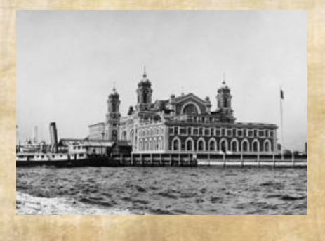
(Right) Ellis Island

(Left) "Bedloe's Island" aka. Liberty Island in 1877