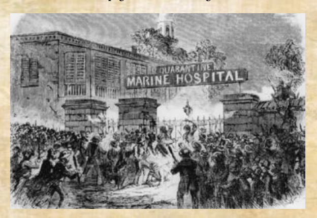
(Above) "Quarantine Marine Hospital" burning down