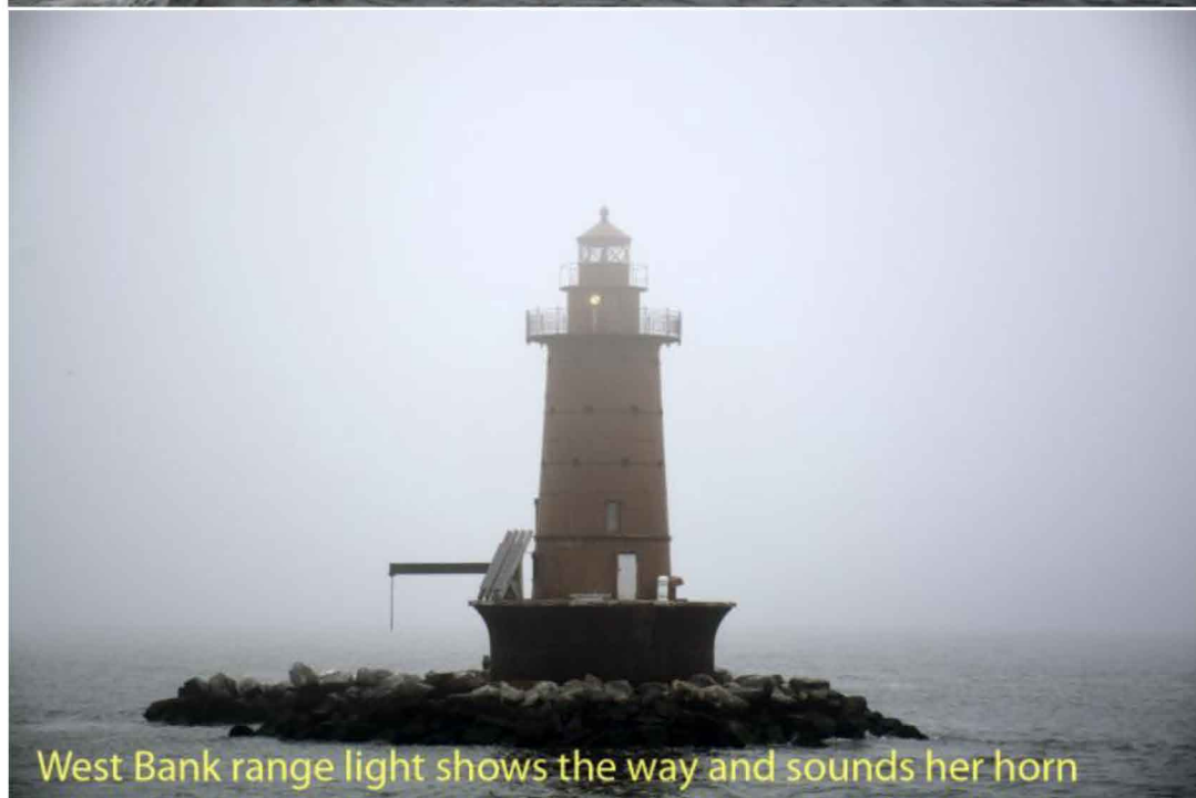
West Bank range light shows the way and sounds her horn