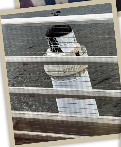
Eleanor Dugan's trip to Scotland