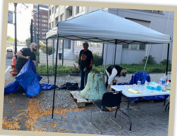
Restoration two Light Station Buoy Bells