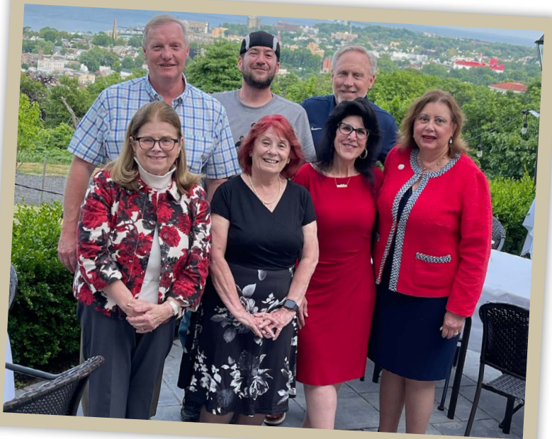
Board of Trustees Annual Meeting 2023