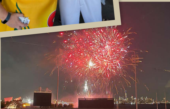
Fireworks at the Stadium