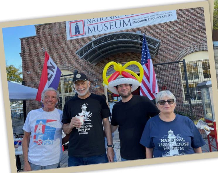
International Point Fest