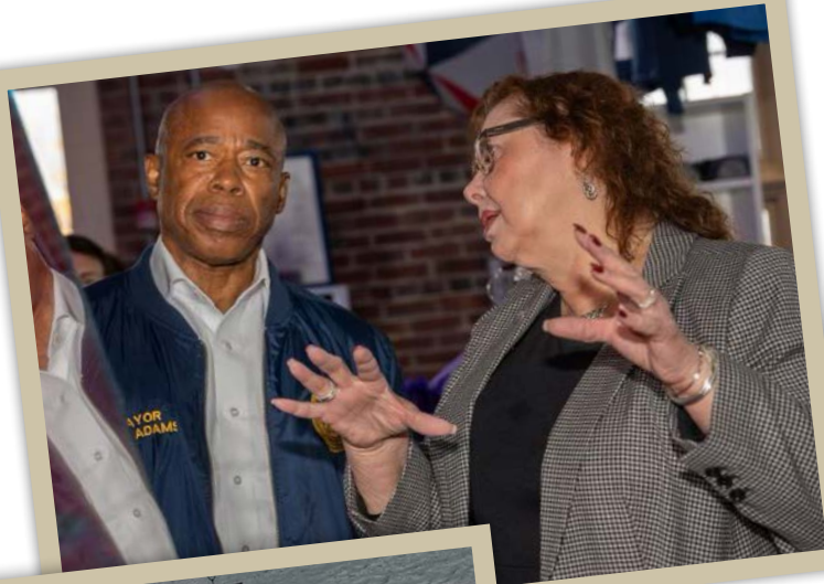
Visit from the Mayor!