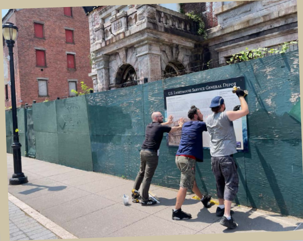
Putting up new site education boards thanks to the generosity of the Richmond County Bank Foundation